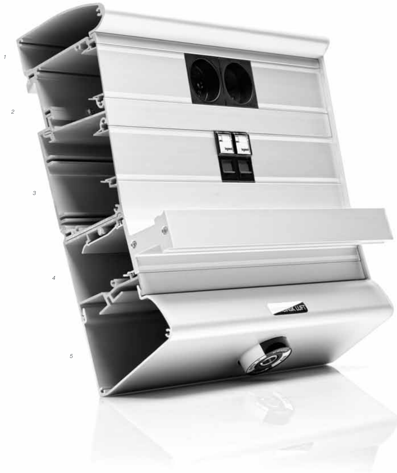
1 - Rounded shelf – possibly with built-in light