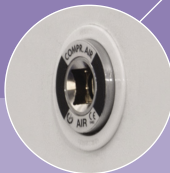
Integration of any gas outlets standard