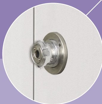
Also available without casing